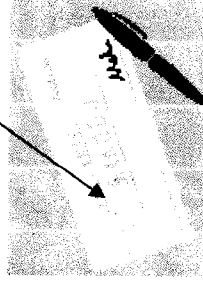
Mails check to Unit for 501c3 account