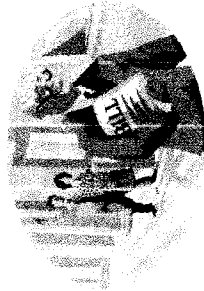
Submits Proposal to 501c3 board.