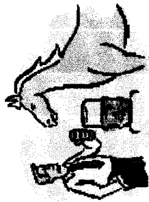
Unit gets idea for project!